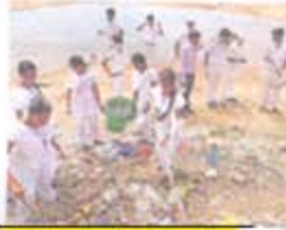
Students cleaning the Cauvery near Amma mandapam in Tiruchi on Wednesday.

Taking cognisance of the problem, the corporation on