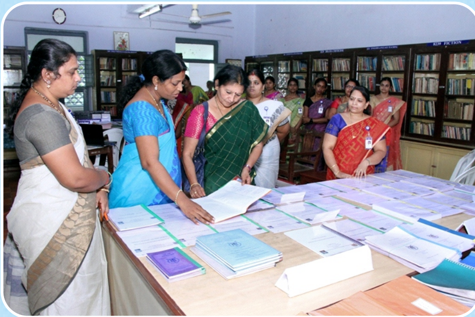
Visit to the Departments