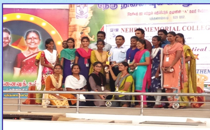
The students of Department of Mathematics received Runner Shield in the State Level Inter Collegiate competition NMC MATH –MMXX organized by Nehru Memorial College on 26.02.2020.