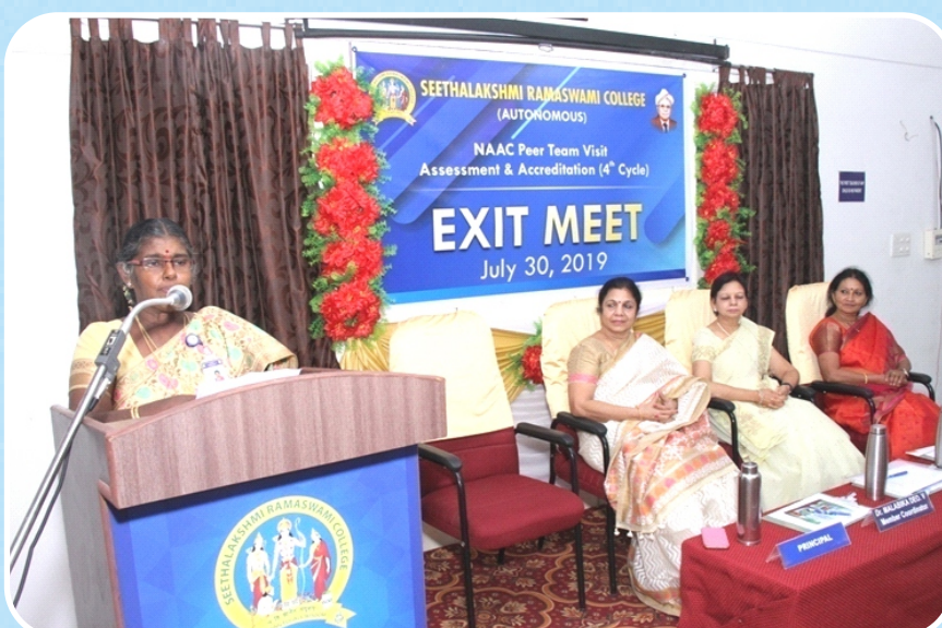
Felicitatation by the Principal