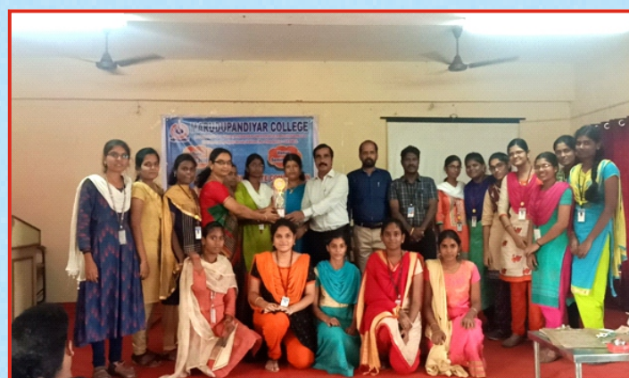
The students of Department of Mathematics received Overall Shield in the State Level Inter Collegiate Competition Math Survivor-2020 held at Marudupandiyar College, Thanjavur.